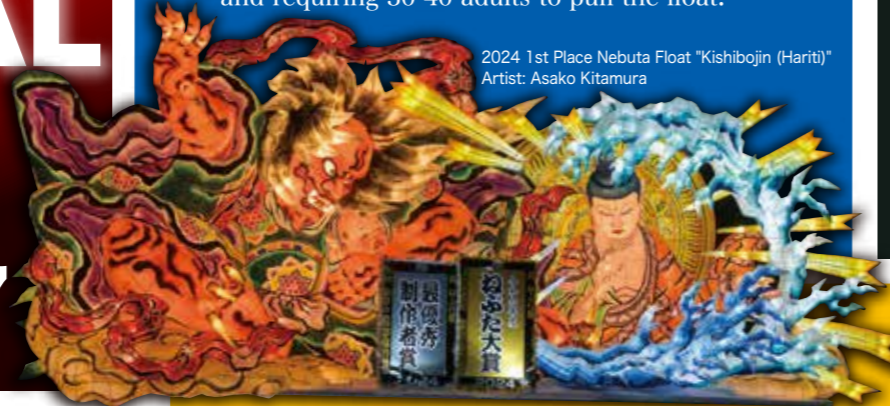
2024 1st Place Nebuta Float "Kishibojin (Hariti)" Artist: Asako Kitamura

"Nebuta" refers to lanterns made of wood, wire, and Japanese paper. These lanterns are inspired by Japanese mythology, history, or Kabuki legends. Historically, bamboo was used to construct Nebuta, illuminated by candles, but today, they are framed with wire and lit by light bulbs. Each large Nebuta is approximately 9 meters wide, 7 meters deep, and 5 meters high, weighing about 4 tons and requiring 30-40 adults to pull the float.